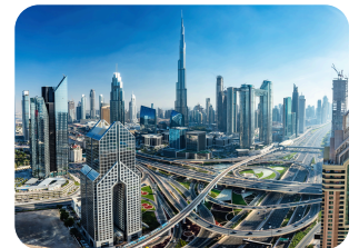
Enterprise Roll Out