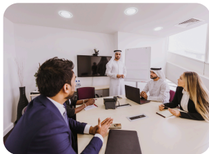
Virtual or F2F Workshops