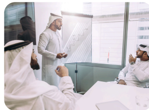
Leadership Development Program