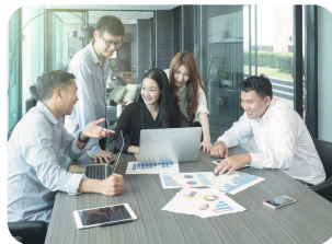
Executive Education Seminars